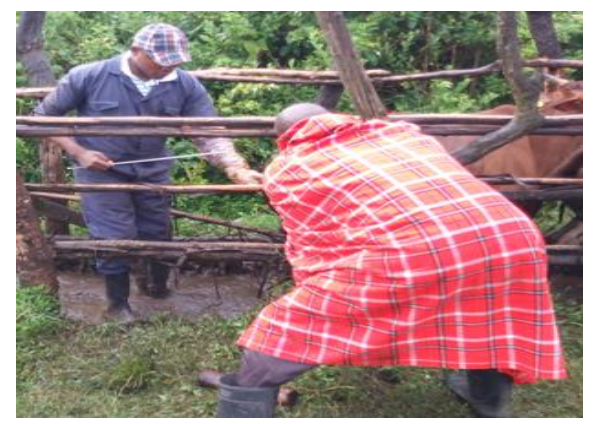
Figure 4 : AI service provider administering semen

productive sustainability of the subsidized semen by the county governments. There is need for increased awareness creation in this regard.