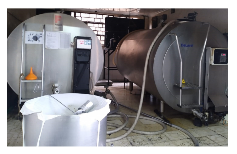
Milk coolers at Kiriita Cooperative Society premises in Kiambu.

Other challenges mentioned are lack of veterinary services and knowledge on value addition and unpredictable weather patterns.