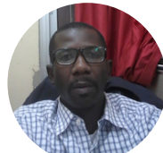
Prof Idy Diop UCAD Topic: AI in the medical field: challenges and opportunities in developing countries